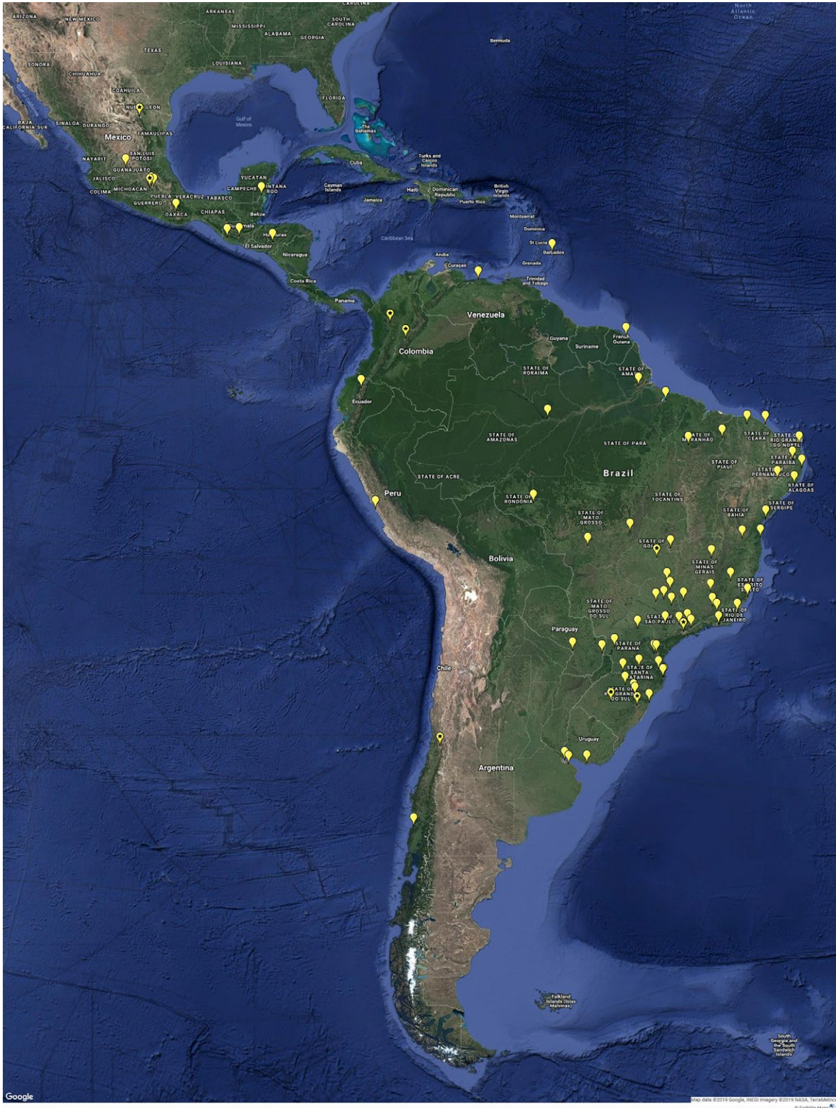
FIGURE 1 Geographic location of centres participating in this survey of diagnostic capabilities in Latin America and the Caribbean. Yellow marks represent institutions that responded to the questionnaire. Yellow marks with a black central star are institutions with the potential to obtain ECMM Blue status by the European Confederation of Medical Mycology (ECMM)