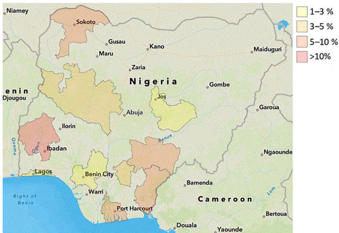
Appendix Figure. Geographic variation in histoplasmosis prevalence from study of prevalence of histoplasmosis among advanced HIV disease patients in Nigeria.