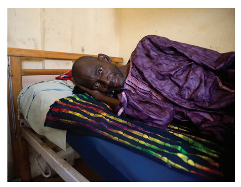
Patient with advanced HIV disease, Conakry, Guinea. 19 February, 2014

The WHO definition of advanced disease is as follows: